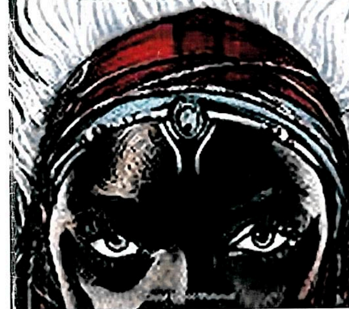
CHILDREN OF BLOOD AND BONE